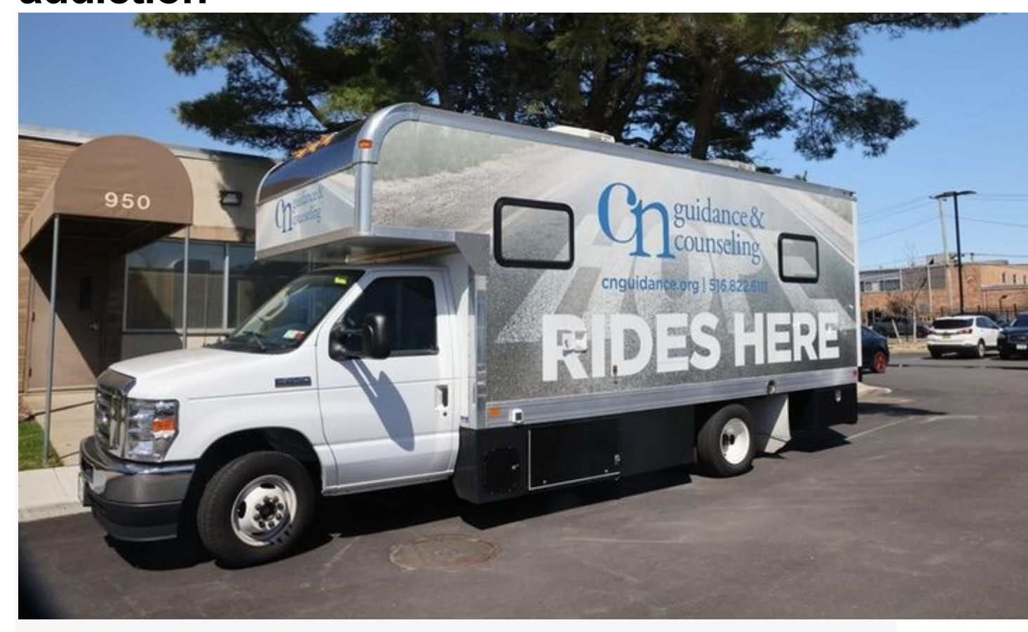
CN Guidance treats about 34,000 patients Island-wide.